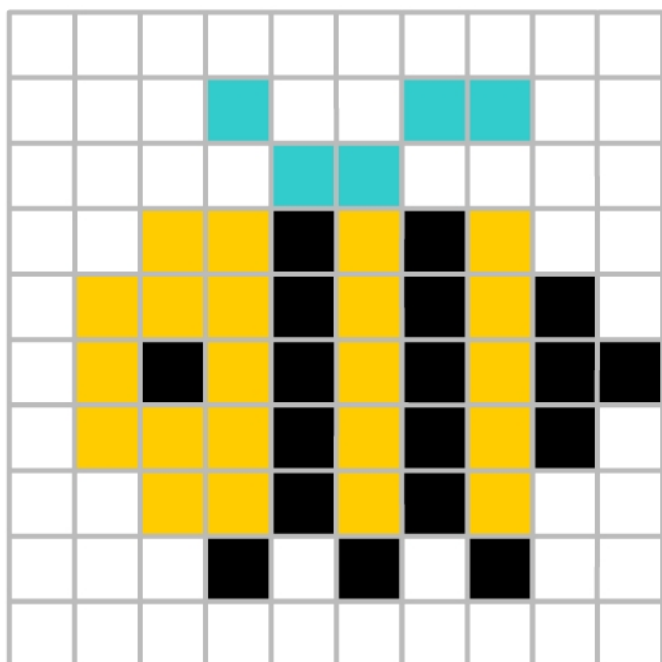
Rysunek 3 - pszczoła